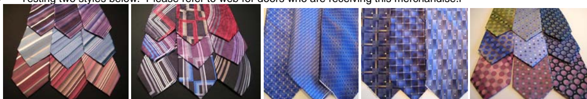
TEST STYLE TEST STYLE