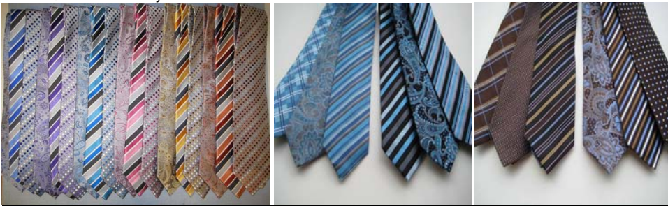
Titanium Wardrobe BT0599V9 Curaco Wardrobe BT0599W1 Mocha Wardrobe