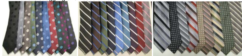
Pointillist Dot Pointillist Stripe PE059905 Porcini Pack