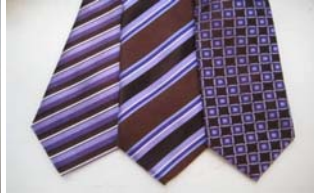
CO059912 Chocolate Wardrobe