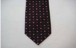
CO055204 Chocolate Dot