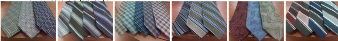
PE051706 Ash Grid PE050618 Column Stripe PE057705 Granite Plaid PE050617 Lime Stone Stripe PE050107 Maple Paisley PE050615 Steel Stripe